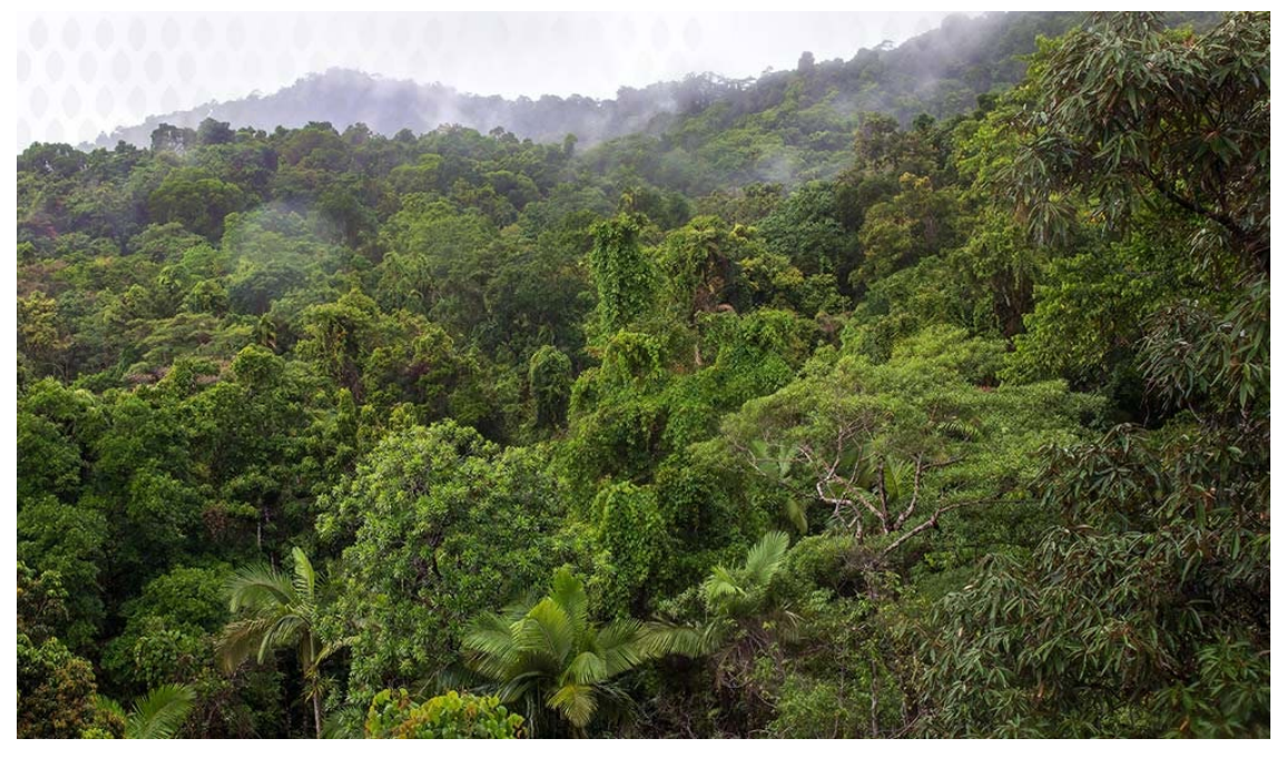
Justification for High Forest, Low Deforestation Crediting

Environmental Defense Fund, Conservation International, World Resources Institute, and Wildlife Conservation Society developed this report with supporting arguments and evidence for why conservatively issued jurisdictional-scale high forest, low deforestation (HFLD) credits are high-integrity and should be considered fungible with any other high-integrity emissions reduction or removal credits.